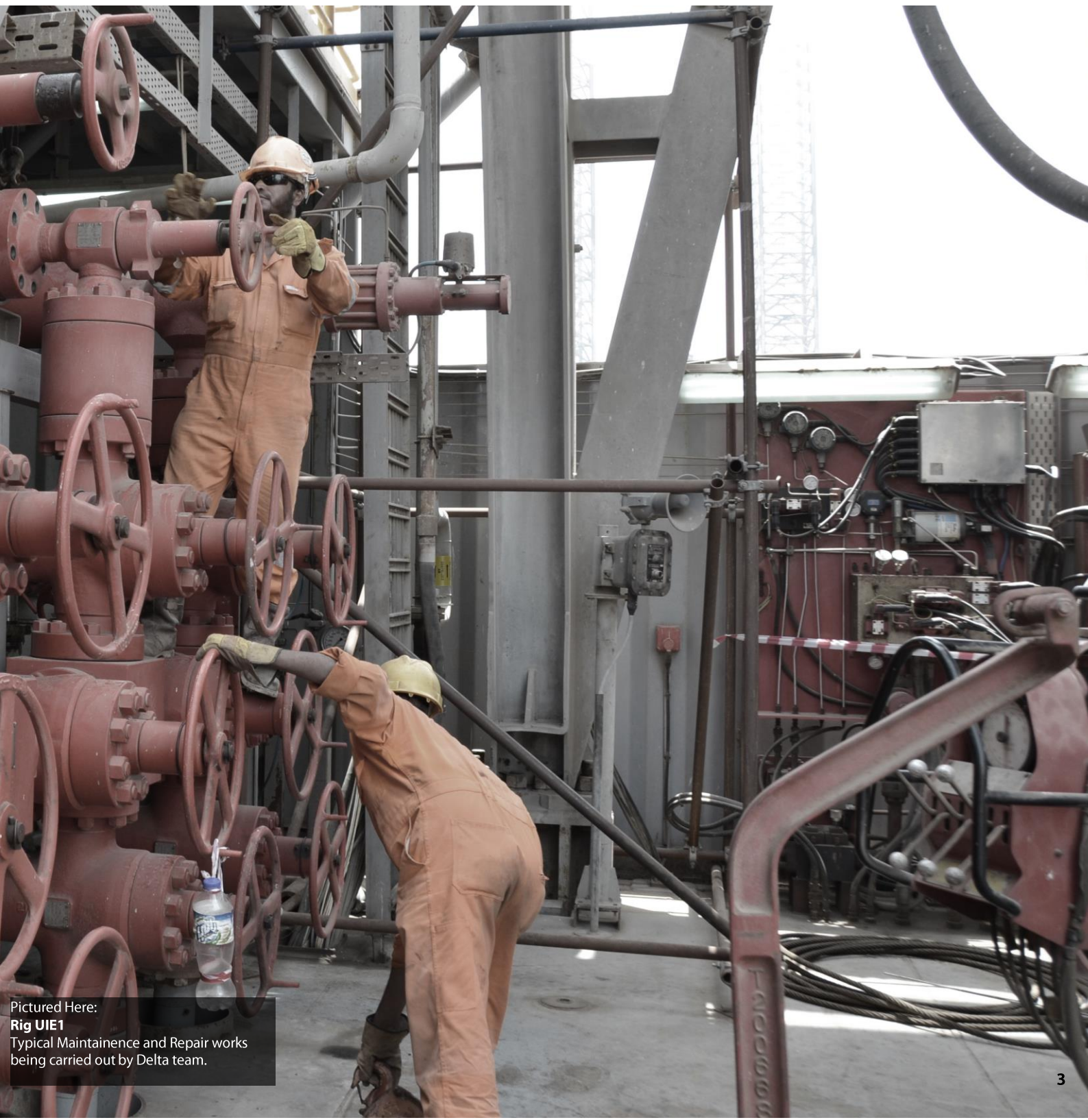
Pictured Here: Rig UIE1 Typical Maintenance and Repair works being carried out by Delta team.

Delta AlMuhitat's biggest asset are its highly experienced staff who have served the Oil & Gas, shipping and transportation industry with dedication and distinction with a combined work experience spanning more than 80 years. We apply market-intelligent resources, core engineering expertise and finely tuned logistical operations to excel in our clients needs. Our strong relationships with the Oil & Gas service providers, equipment manufacturers and suppliers covers all operational requirement of fleet under our management in shortest possible time to prevent any downtime and optimized operational performance of fleet managed, while Safety, Health and Environmental aspects are always maintained at highest standard, without sacrificing on performance and responsibility.