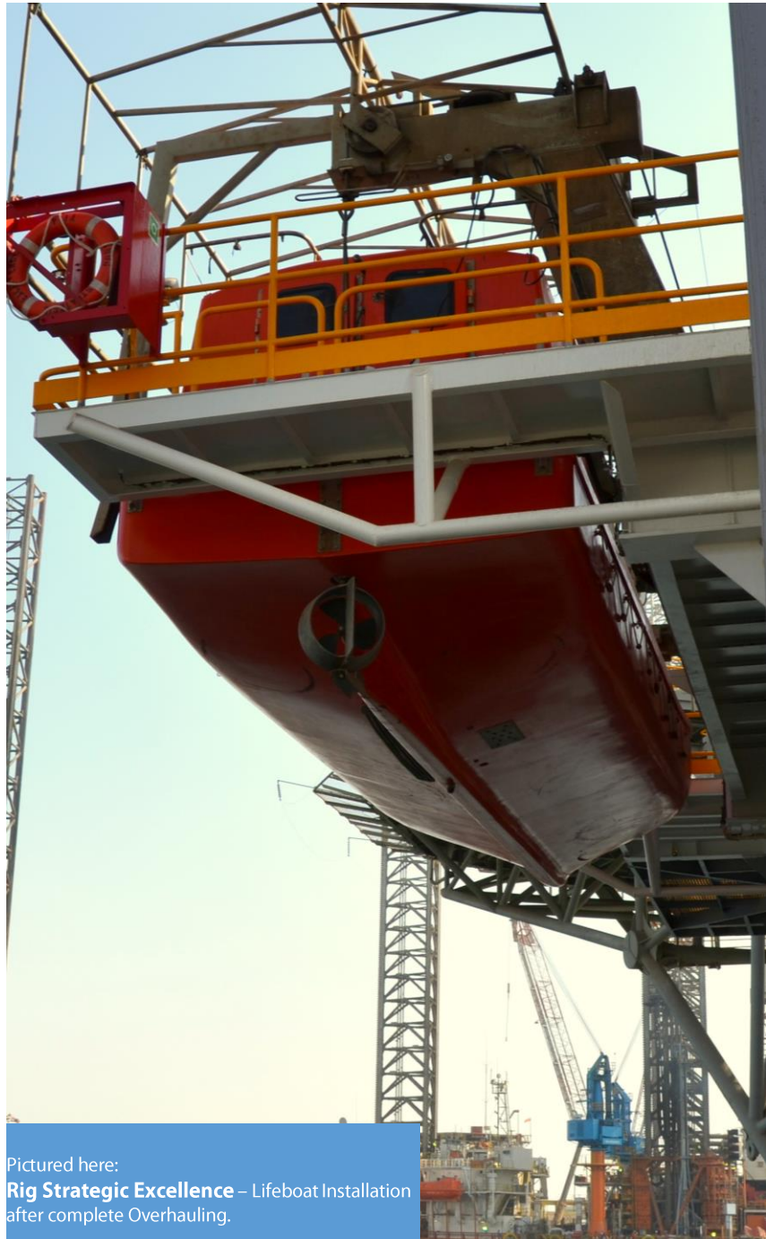
Pictured here: Rig Strategic Excellence – Lifeboat Installation after complete Overhauling.